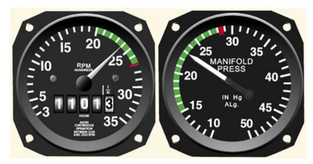
Figure 6. RPM and Manifold Pressure Gage.

It is a fallacy that (in non-turbocharged engines) the manifold pressure in inches of mercury (inches Hg) should never exceed r.p.m. in hundreds for cruise power settings. The cruise power charts in the AFM/POH should be consulted when selecting cruise power settings. Whatever the combinations of r.p.m. and manifold pressure listed in these charts—they have been flight tested and approved by the airframe and powerplant engineers for the respective airframe and engine manufacturer. Therefore, if there are power settings such as 2,100 r.p.m. and 24 inches manifold pressure in the power chart, they are approved for use.