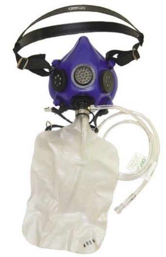
Figure 10. Continuous flow mask and rebreather bag.

Continuous-flow oxygen systems are usually provided for passengers. The passenger mask typically has a reservoir bag, which collects oxygen from the continuous-flow oxygen system during the time when the mask user is exhaling. The oxygen collected in the reservoir bag allows a higher aspiratory flow rate during the inhalation cycle, which reduces the amount of air dilution. Ambient air is added to the supplied oxygen during inhalation after the reservoir bag oxygen supply is depleted. The exhaled air is released to the cabin. [Figure 10]