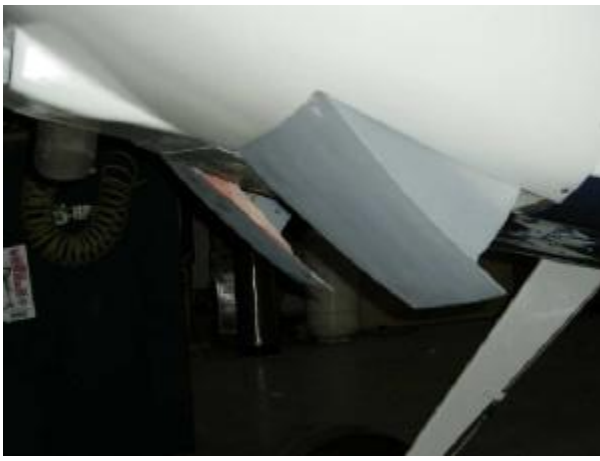
Figure 7. Cessna 182 Cowl Flaps

Air cooling is accomplished by air flowing into the engine compartment through openings in front of the