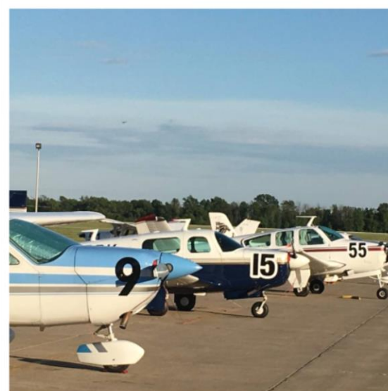
At the timing line with all the timers!

My job was to find and coordinate timers to time the racers as they sped across the timing line, and did we have a lot of FUN watching the racers cross that line at full power and only 200 AGL :) Can't wait to be IN the race next year ;) -Jessica