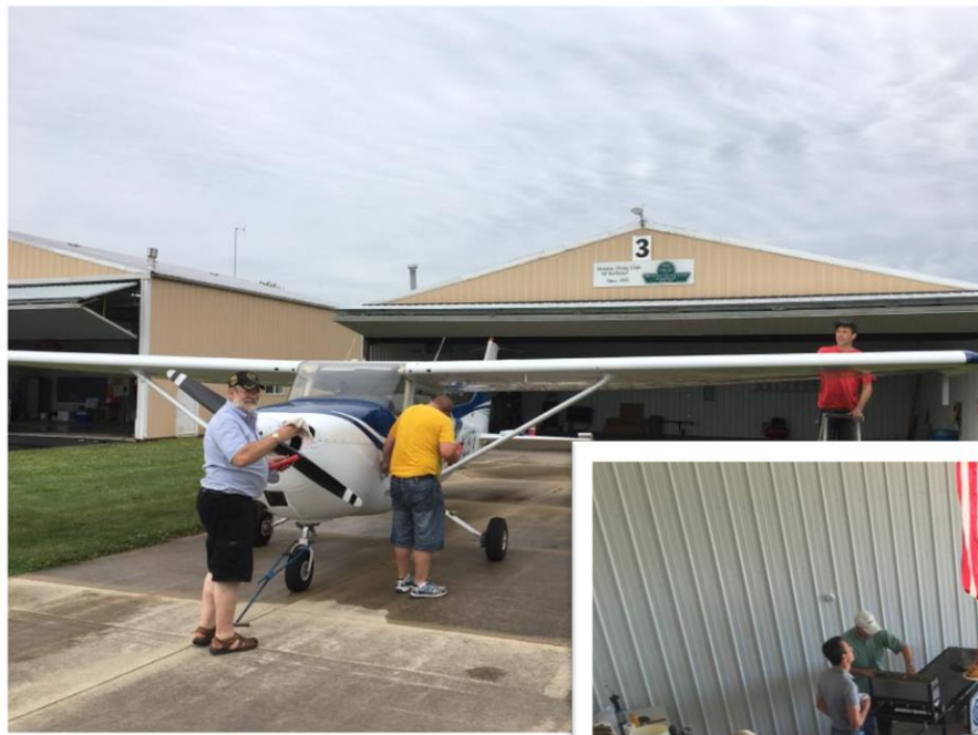
Airplane wash day

Our annual pancake breakfast was a success...we had about 250 show up and made a profit of $618 :) We lost track of how many airplanes flew in!